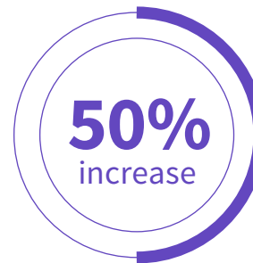
Of users reached by adding push