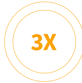
Revenue from email and push

The old tools were also cumbersome to use and offered limited functionality. Worse yet, they didn't support the team's AI driven, omni-channel marketing strategy, which includes reaching customers through SMS, in-app messaging, and social media.