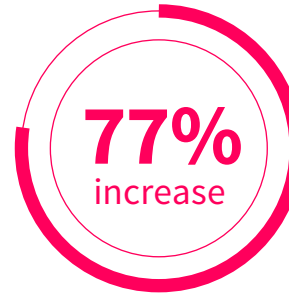
4Q17 sales attributable to ad hoc email using data feeds